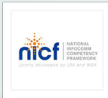
National Infocomm Competency Framework (NICF)