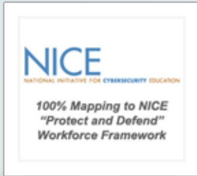
The National Initiative for Cybersecurity Education (NICE)